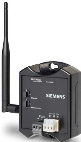
Figure 3. Field Panel Transceiver (FPX).

Once installed and powered, the transceivers automatically form the mesh network, and the WFLN's wireless mesh communication is virtually transparent to the system and end user.