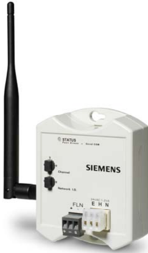
Figure 2. Field Level Network Transceiver (FLNX).

To implement the WFLN, a Field Level Network Transceiver (FLNX) is mounted at the FLN device and a Field Panel Transceiver (FPX) is mounted at the field panel. Both must be powered by 24 Vac. The transceiver antenna can be mounted either directly or remotely. In cases where the radio transceiver is mounted in a metal enclosure, the remote mount antenna would be used. The transceivers are plenum rated for direct mount without an enclosure.